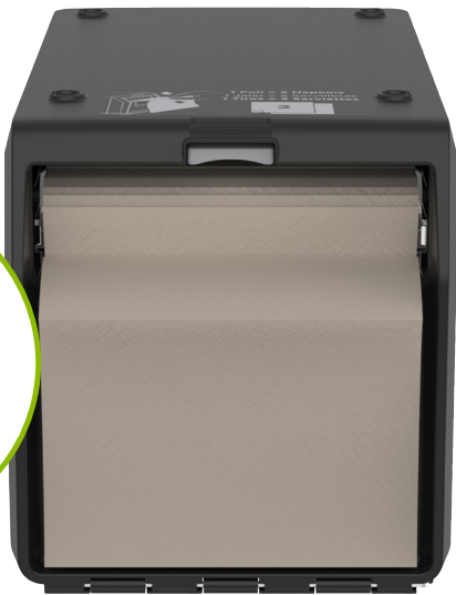
Take-Two Dispenser SKU 54555A - DSTR# 552955

The newest addition to the Interfold family