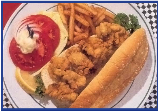
Oyster Po-Boy $7.99

Premium Dipt'n Dusted® Oysters served on an oven baked French roll with lettuce and tomato. Accompanied by French fries. BEK # 480591