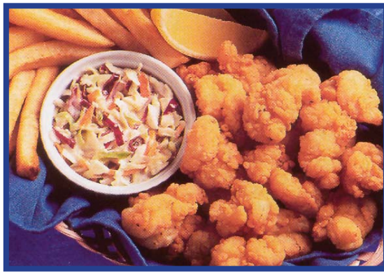
Shrimp Tender Basket $5.99

Tail-off butterflied shrimp coated in our Dipt'n Dusted® breading. Served with creamy cole slaw and French fries. BEK # 470919