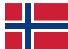
Product of Norway